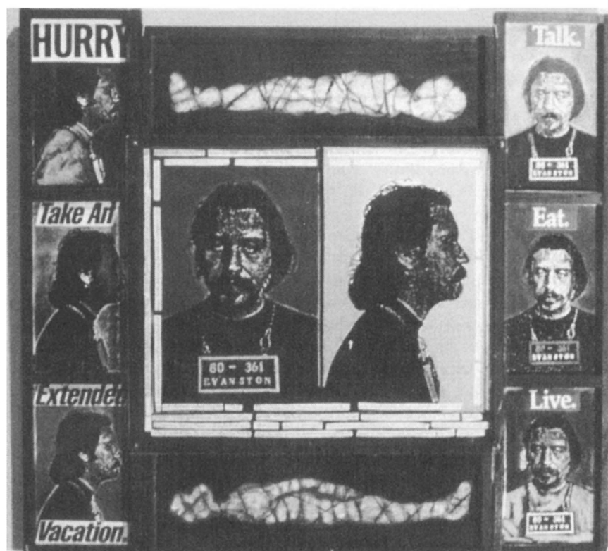
Extended Vacation , 1994, acríoleo and gesso on collage photocopies on wood, 16 × 17.75 inches.

processes are national epics manipulated in the name of the people to legitimize social control and coercion. To resolve these contradictions we must assume the class struggle in all its diverse forms and confront the questions of Power. Only then will the immense majority of excluded, oppressed, and exploited obtain the real power. But we cannot wait for the day when the majority will rule in order to bring forward the structures needed for building a free, just, egalitarian, and non-classist society. We must build within the ruins and the hostilities of present conditions by creating transitional alternatives now. We must build socioeconomic, political, and cultural structures that are controlled by those struggling for change and the communities they serve. These structures, "schools" for discussing all these problems, will put into practice the notion that only by confronting the reality of subjection can we begin to be free to create an art of liberation that frees people from the illusions perpetrated by dominant culture.