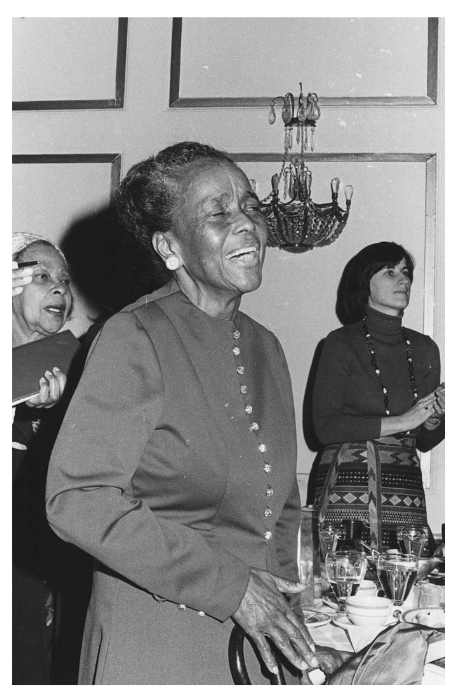
Ella Baker singing at scef luncheon, 1970s.