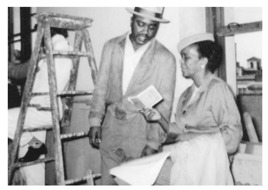
Ella Baker with unidentified man in Shreveport, Louisiana, 1959.