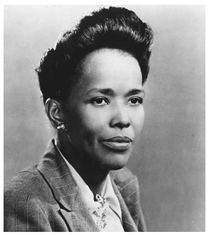
Ella Baker in suit, ca. 1942.