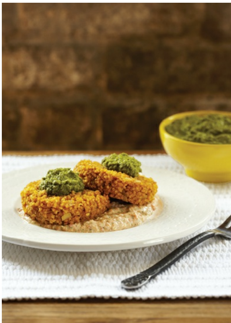
Curried Millet Cakes with Red Pepper Coriander Sauce

► The Barbecue Millet Balls can also be made into Swedish “Meatballs,” probably the most well-known Scandinavian dish. Prepare the millet balls as in the variation above, through baking. While the millet balls bake, place 2 batches of No-Cheese Sauce in a small saucepan and add 1 teaspoon nutmeg. Cook over low heat until heated through, about 5 minutes. To serve, divide the millet balls between six plates and spoon the sauce over them (again, the millet balls do not sit well in sauce for any length of time, so add the sauce no more than 5 minutes before serving). Serve these over pasta, with brown rice, or as an appetizer at your next potluck.