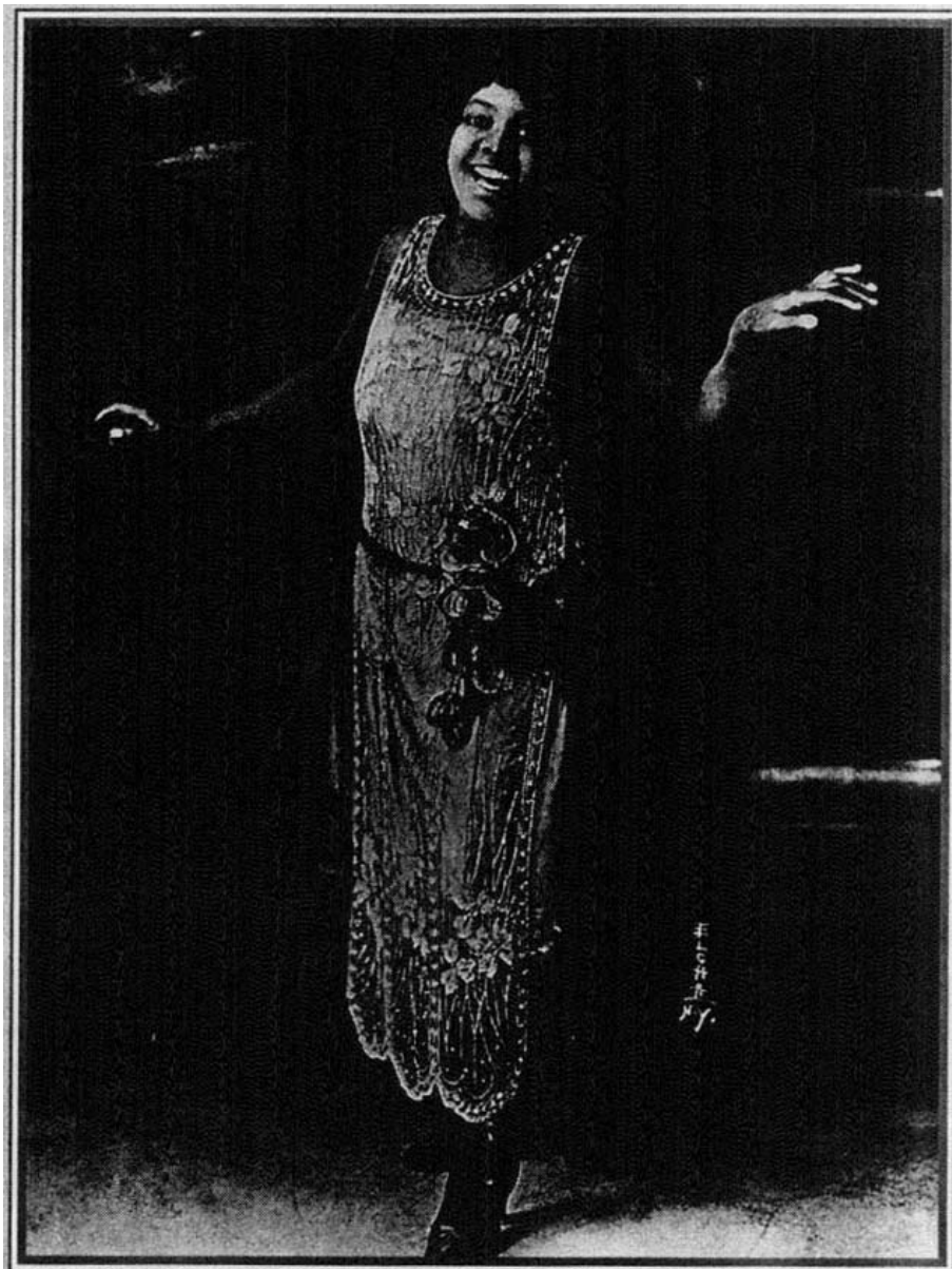
Women's blues provided a cultural space for community building among working-class black women, as well as a space devoid of bourgeois notions of sexual purity and "true womanhood."