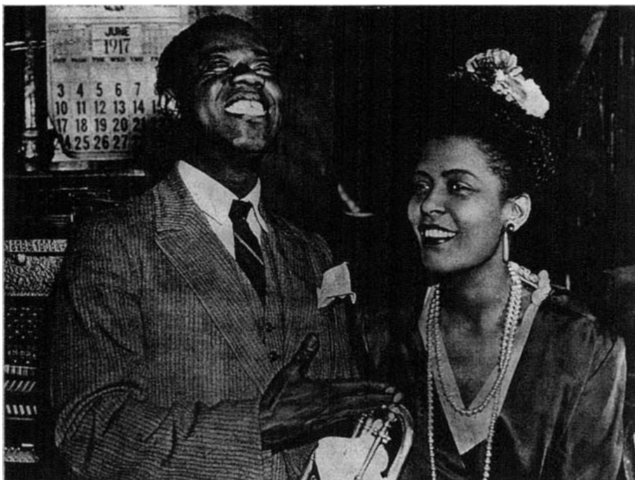
As a jazz musician who worked primarily within the idiom of white popular song, Lady Day transformed already existing material into her own form of modern jazz. In the process, she had a lasting influence on vocalists and instrumentalists alike. She is pictured here with Louis Armstrong on the set of the movie New Orleans in 1946.