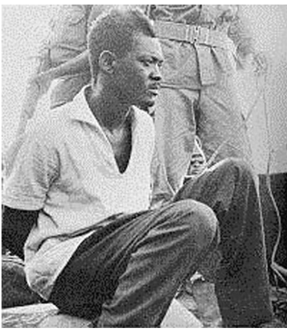
Patrice Lumumba as the first nationally elected Prime Minister of the Congo, in 1960; and as a prisoner shortly before his execution in 1961, under the "supervision" of a United Nations occupying force.

inexperienced co-workers. This happened after the second province of the country—the diamond-rich province of East Kasai—wanted to split off, and the Congolese national army was not in a position to stop the "balkanization" of their country.