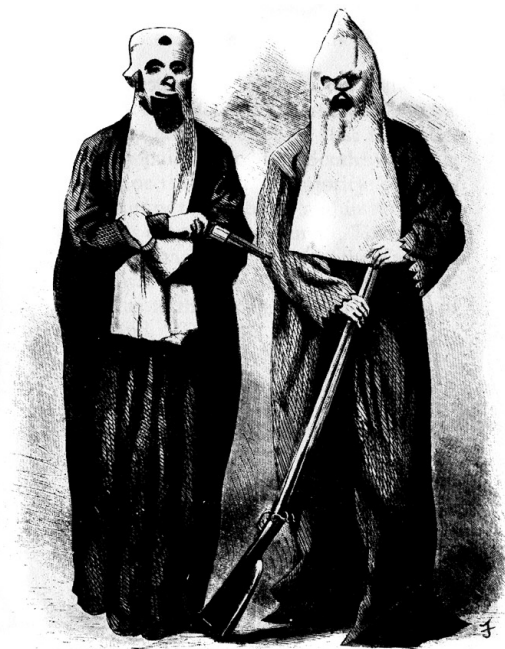
COSTUMES WORN IN TENNESSEE AND NORTH ALABAMA FACING PAGE 97