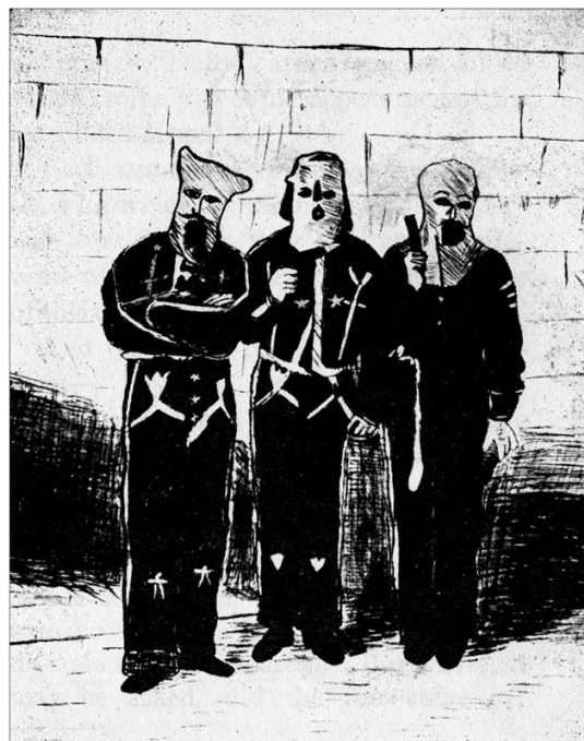
COSTUMES WORN IN MISSISSIPPI AND WEST ALABAMA FACING PAGE 58