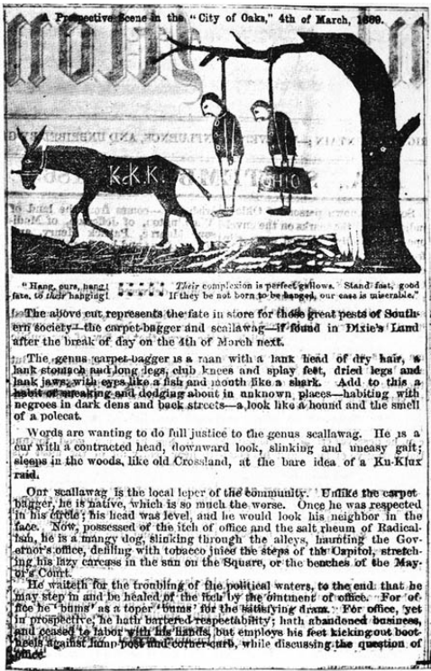
THE FATE OF THE CARPETBAGGER AND THE SCALAWAG Cartoon by Ryland Randolph in Independent Monitor , September 1, 1868.